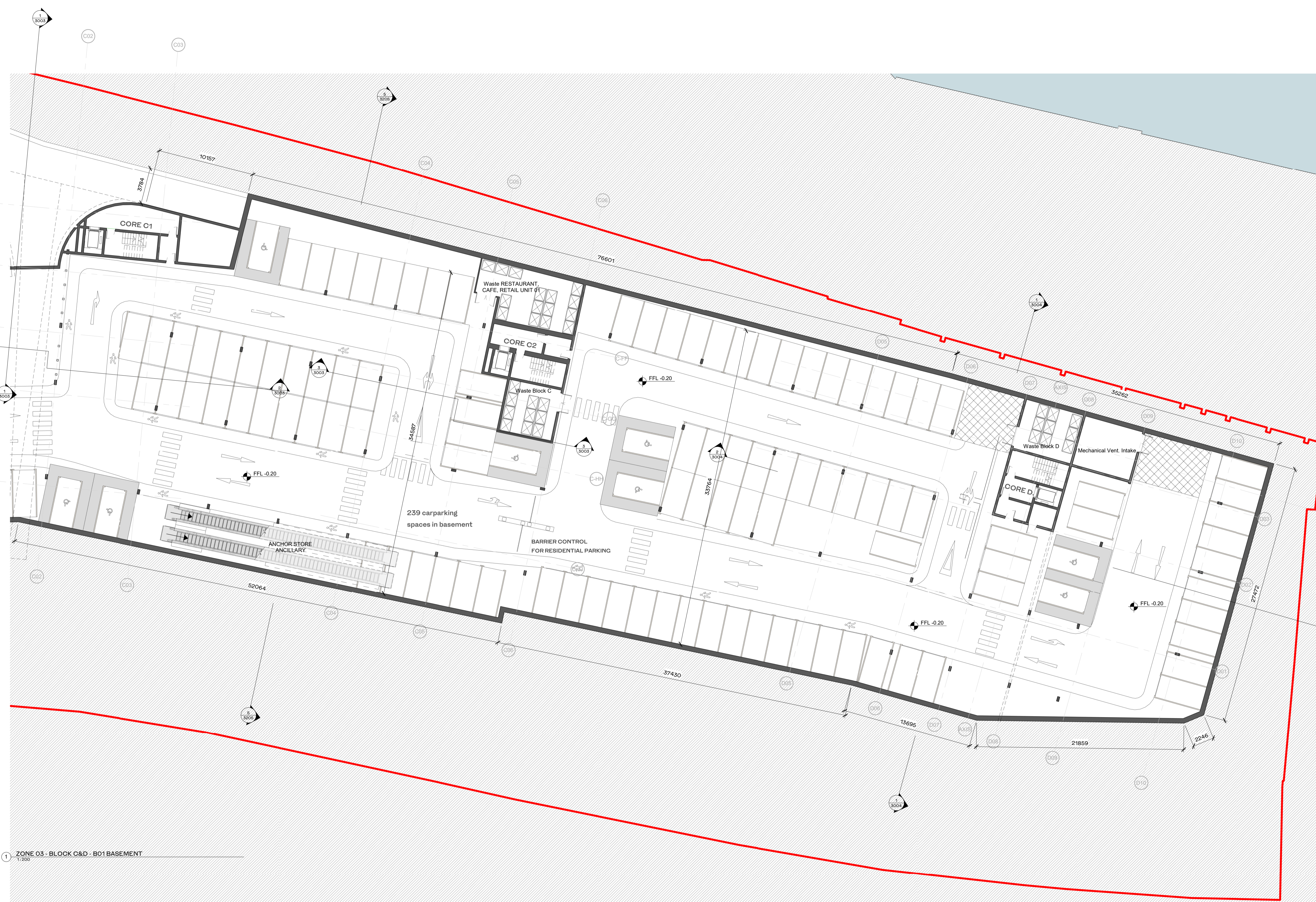
1 ZONE 03 - BLOCK C&D - B01 BASEMENT 1:200

REVISION P2 DRAWING NUMBER CLR-HJL-03-B01-DR-A-1008CD STATUS CODE: A1